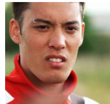
Maddox - Tessy tantrum