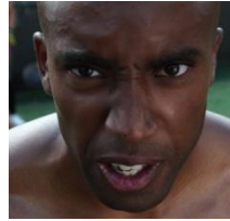
Kingston - Drama Queen