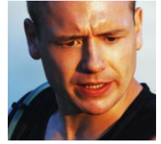
Archer – Closet case